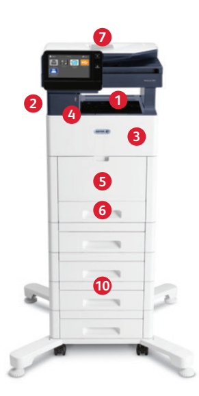
Xerox® VersaLink C505 Colour Multifunction Printer