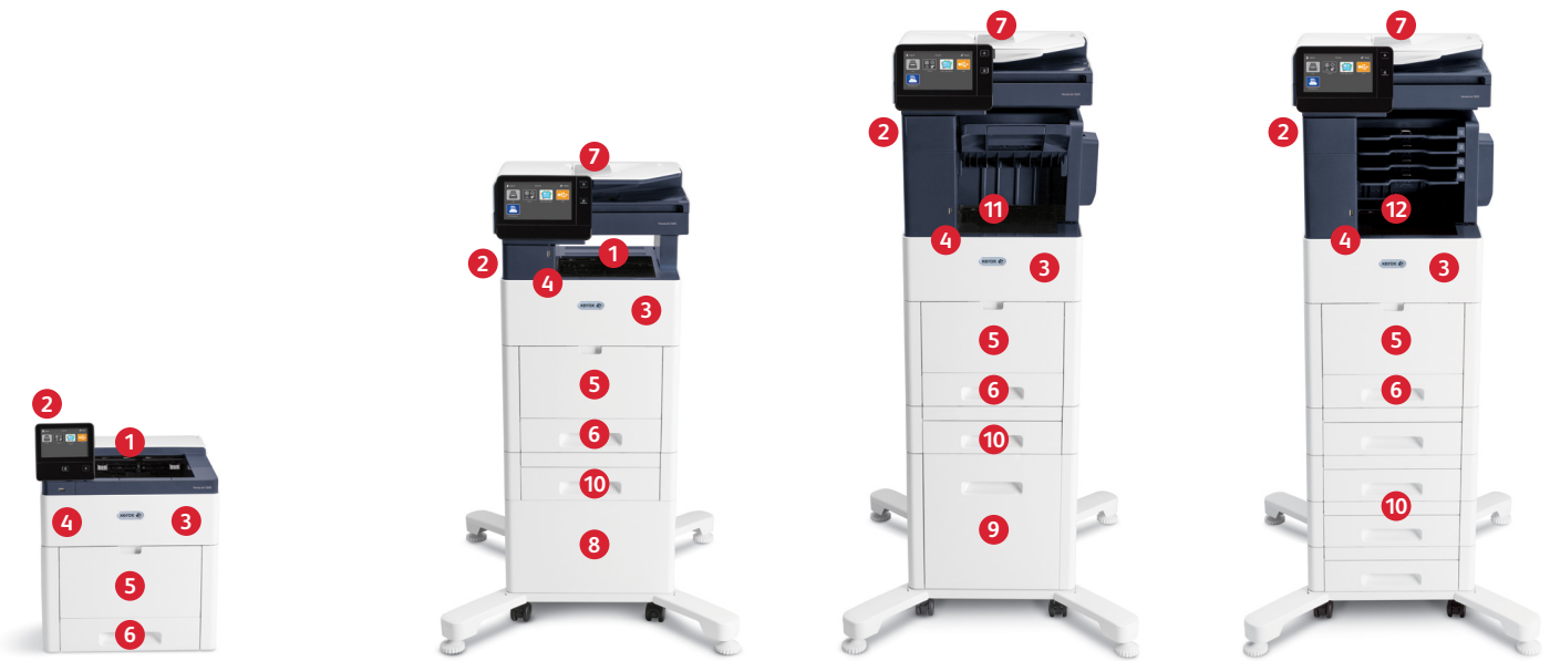
Xerox® VersaLink C600 Colour Printer Print. Mobile connectivity.